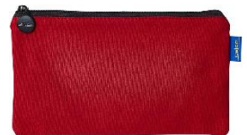
Soft Pencil Case