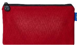
Soft Pencil Case